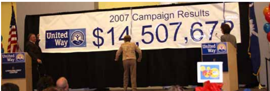
Volunteers unveil the final 2007 campaign results at the Final Campaign Report Meeting.