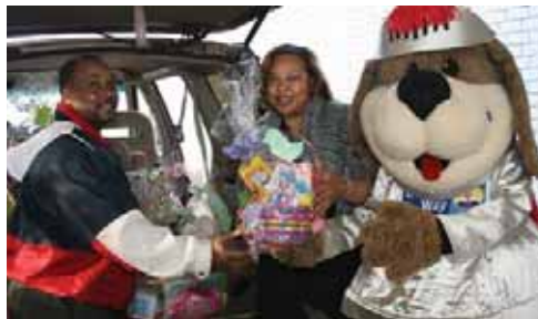
Sir Thanksalot, United Way's mascot, helps load up Easter baskets that are being delivered to a local Head Start program. Through United Way's "Be a Bunny" project, more than 80 companies provided Easter baskets to 2,800 children in need and senior citizens.