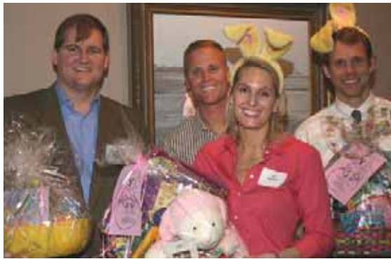
Young Philanthropist members provided Easter baskets to children from low-income families and senior citizens as part of United Way's annual "Be a Bunny" project.