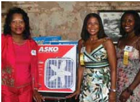
African American Leadership members donated fans to help seniors in need as part of their "FANTastic" event last summer.