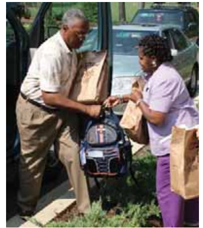
The United Way/BI-LO School Tools project provided school supplies so that children from low-income families could be able to start school ready to learn. More than 80 companies participated, providing supplies to more than 2,400 students.