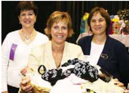
Women's Leadership members donated undergarments as part of their annual "Wear One, Bring One" initiative. Undergarments collected were given to a local women's shelter.